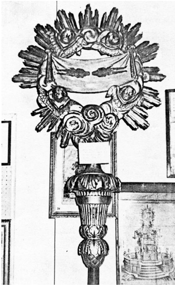
AT LEFT: AN EARLY REPRESENTATION OF THE HOLY SHROUD ON DISPLAY AT THE CENTRO INTERNAZIONALE DI SINDONOLOGIA IN TURIN