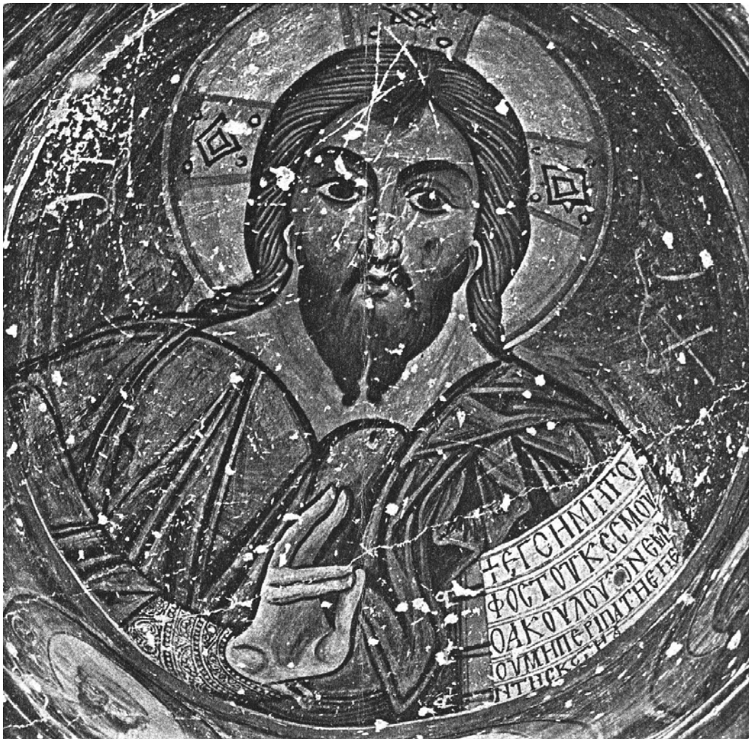
CHRIST PANTOCRATOR, KARANLIK KILISE, GOREME, CAPPADOCIA