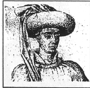
Duke Louis of Savoy

1453 22 March. Margaret de Charny, at Geneva, receives from Duke Louis I of Savoy the castle of Varambon and revenues of the estate of Miribel near Lyon for 'valuable services'. Those services are reliably thought to have been the bequest of the Shroud. An exceptionally pious couple, Duke Louis and his wife Anne of Cyprus surrounded themselves by Franciscans, and when in July of this, year an envoy of King Charles VII of France visits Louis in Geneva, he is lodged with the Cordeliers. Later Louis will assume the habit of a Franciscan as mourning upon the death of his wife Anne of Cyprus.