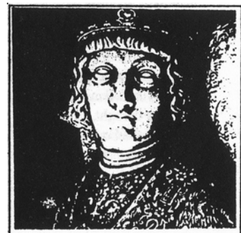
Duke Louis of Savoy