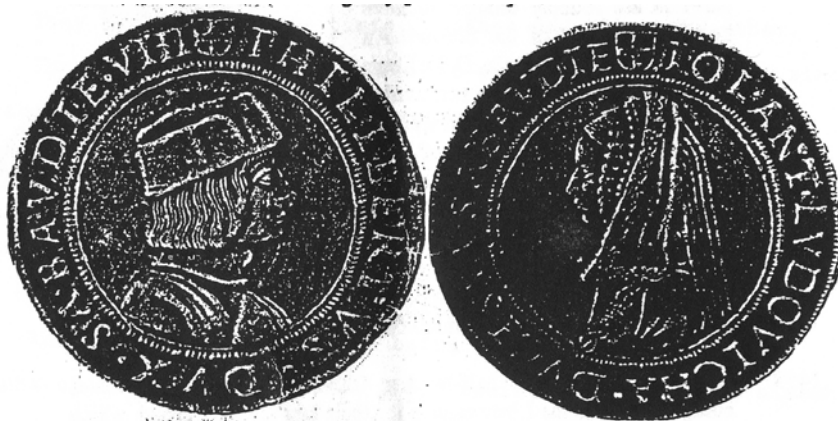
Savoy four testones, featuring Duke Philibert I on the obverse and his mother the dowager Duchess Yolande on the reverse [from Treasures of the Hermitage , New York & Leningrad, Portland House, 1987]