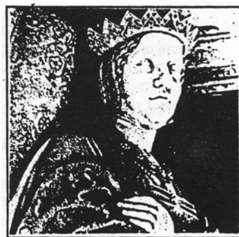
Margaret of Austria, Duchess of Savoy

1505 5 May. By a special treaty Duchess Margaret relinquishes custody of the Shroud to her mother-in-law, the pious dowager duchess Claude de Brosse de Bretagne, widow of Duke Philip II of Savoy, and mother of the new Duke Charles III. Dowager duchess Claude de Brosse has a special devotion for the Shroud and temporarily keeps it with her, it is thought, in her castle of Bylliat en Michaille, near Nantua, Ain (between Bourg-en-Bresse and Geneva).