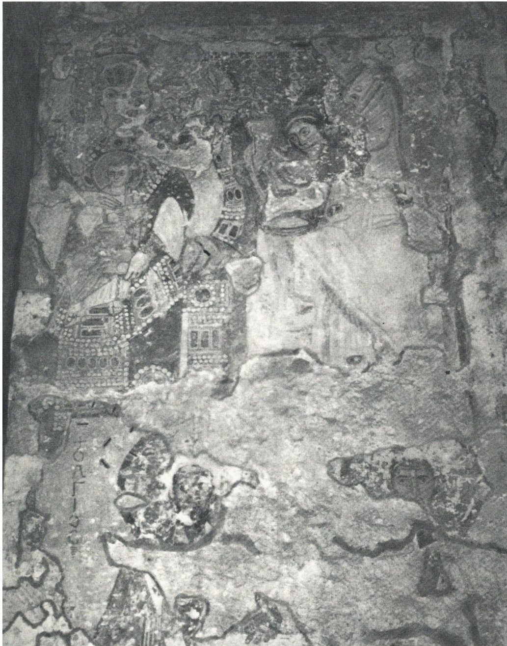
Santa Maria Regina, on the Palimpsest Wall