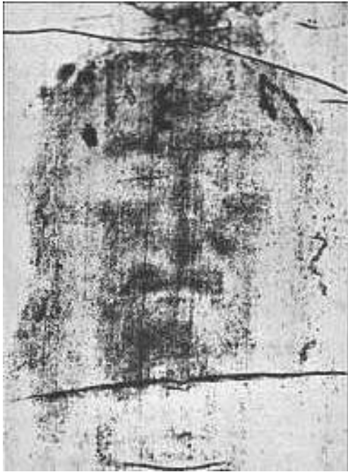
Detail of the face, showing negative imprint and weave of the cloth. The transverse lines are shaded wrinkles.

I N 1902 the Scientific American 1 reprinted a report which I submitted to the Academy of Sciences at Paris relative to the remarkable cloth known as the Holy Shroud. This cloth, preserved in Turin, Italy, is venerated as the winding-sheet of Christ. Upon it are two figures, which represent the front and the back of a human body and are believed to be the imprints of the Body of Christ. In 1898, when the Shroud was photographed for the first time, it was discovered that the lights and shades of these figures are reversed as in a photographic negative. This led me to make a series of studies and experiments, in which I was assisted by several colleagues at the Sorbonne. Our findings in the laboratory tended to confirm the traditional belief about the figures on the Shroud. On the basis of several historical documents, however, many scholars, Catholic as well as non-Catholic, maintained that the figures (page 148.— Ed. ) are paintings, dating from about the middle of the 14th Century.