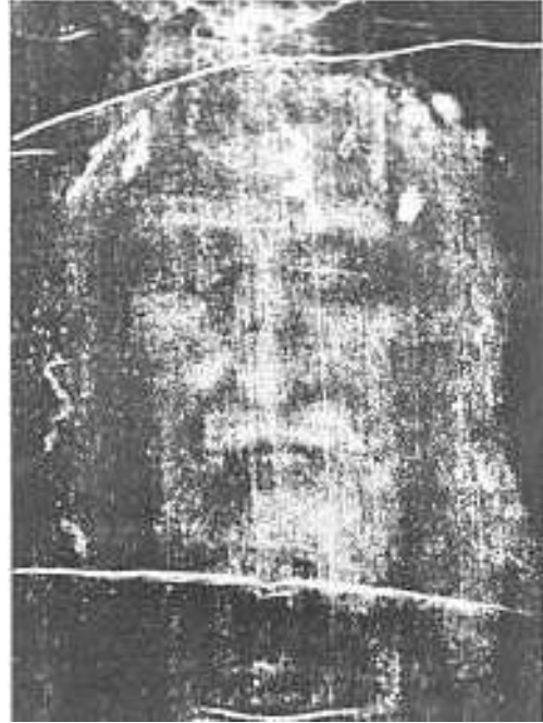
How the face appears when the lights and shades are reversed by photography. Above the head is a water stain.

Neither is there any difficulty in a cloth being preserved intact for 19 centuries. The Shroud, which is made of linen, is actually in a good state of preservation, except where it was damaged by fire; 2 but there are Egyptian linens 3000 years old which are still as good as new. There is just as little difficulty in the fact that the Shroud is woven in a twill pattern, for the ancients wove twilled fabrics of excellent workmanship, and the art of weaving was highly developed at the beginning of the Christian era.